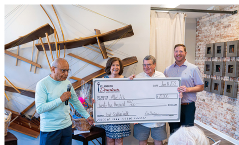
The CID Check Presentation

This program is possible thanks to the St. Joseph Downtown Community Improvement District , the program's primary funding partner, the City of St. Joseph, and the many individuals and businesses who sponsor the event each year.