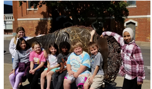
School Sculpture Walk Tour 2022