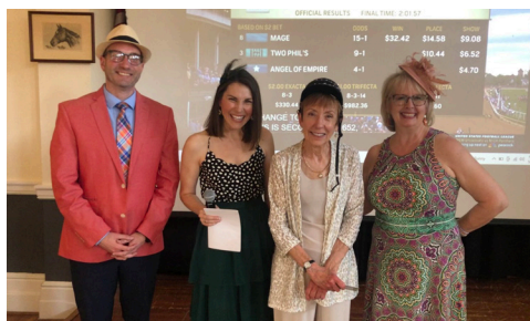
Kentucky Derby Fun!