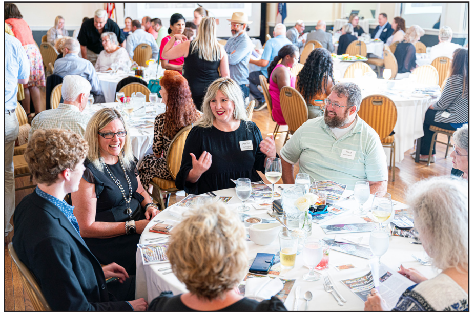
A record number of guests joined in celebrating the Mayor's Awards for the Arts at the Benton Club in July.